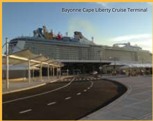
Bayonne Cape Liberty Cruise Terminal