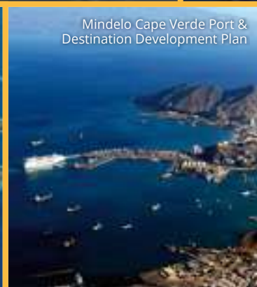
Mindelo Cape Verde Port & Destination Development Plan