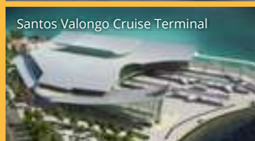
Santos Valongo Cruise Terminal