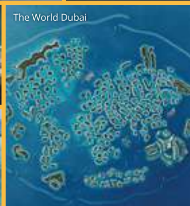
The World Dubai