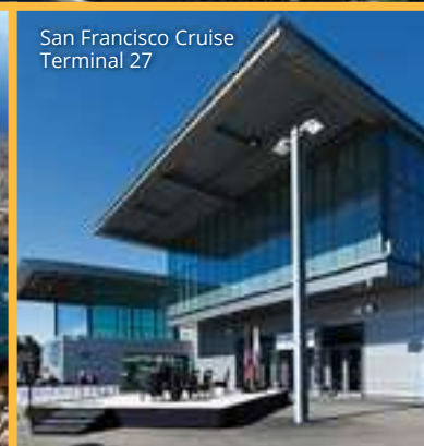
San Francisco Cruise Terminal 27