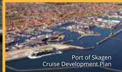
Port of Skagen Cruise Development Plan