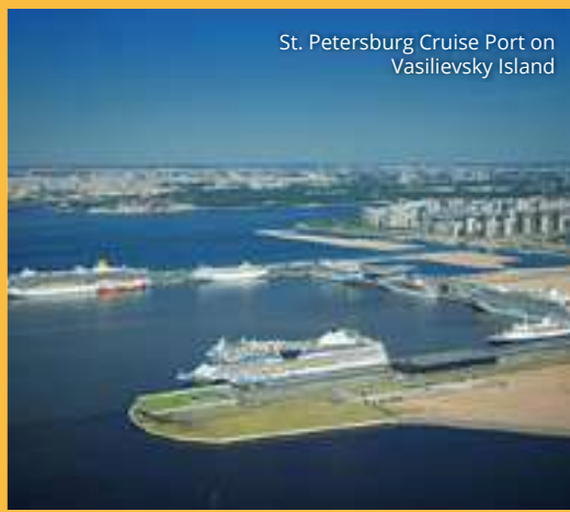
St. Petersburg Cruise Port on Vasilievsky Island