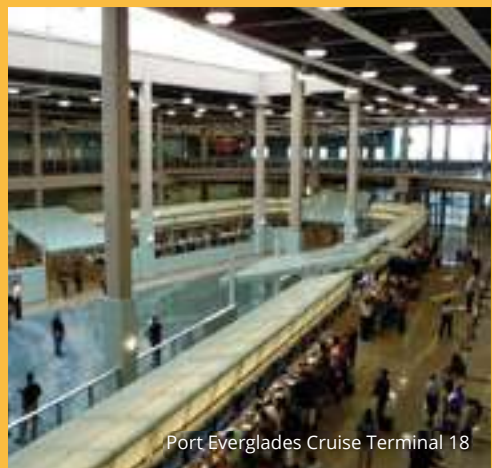
Port Everglades Cruise Terminal