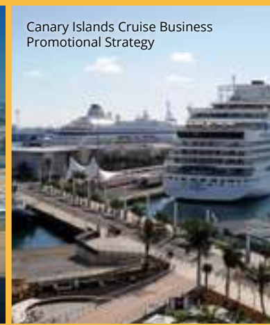
Canary Islands Cruise Business Promotional Strategy