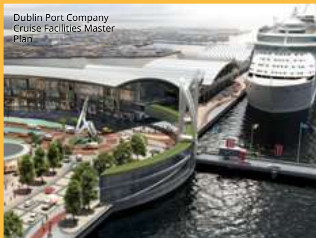
Dublin Port Company Cruise Facilities Master Plan