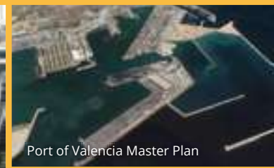
Port of Valencia Master Plan