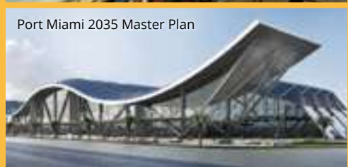
Port Miami 2035 Master Plan