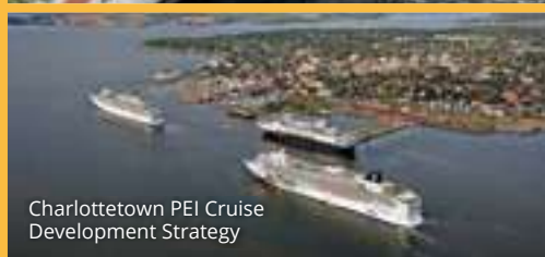
Charlottetown PEI Cruise Development Strategy