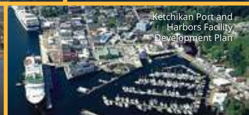
Ketchikan Port and Harbors Facility Development Plan